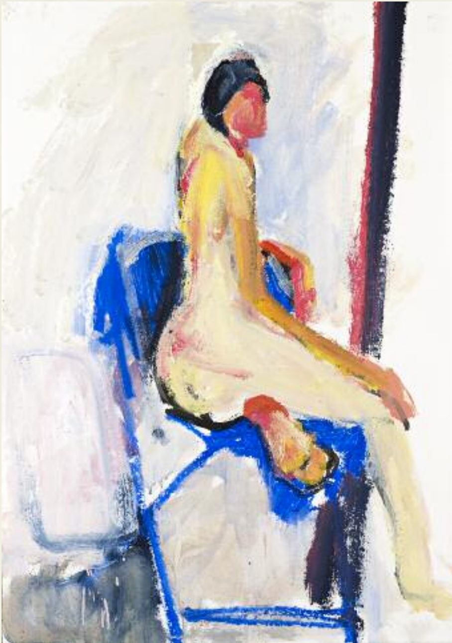
NUDE, BLUE CHAIR

Oil, oil bar and Indian Ink · 84 x 59.5 cm